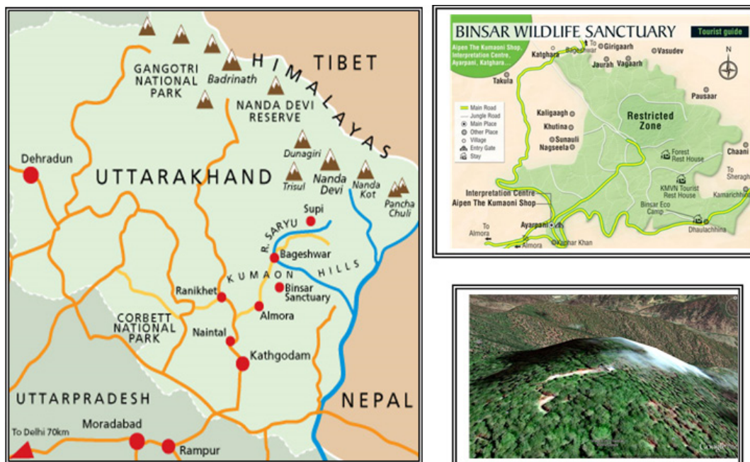
Fig. 1. (a) Location of the study area 29.63° N, 79.33° E- Binsar wildlife sanctuary (b) Sampling site of pine (indicated as red triangle) and oak (indicated in blue triangle). (c) 3D view of Binsar Zero Point (8000 ft) - Dense Oak canopy site

In the present study, oak and pine canopy cover greatly affected soil MBC (Table 2). Our results suggest the increase in organic matter enhances the proliferation of microbes in soil in agreement with earlier studies (Haynes, 1999, 2000, Wu et al., 2004). The higher MBC values observed in the undisturbed oak forest similar as in