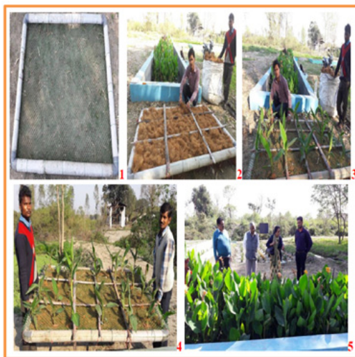
Fig. 2. Pictorial representation of FRWTS at GBPUA&T, pantnagar