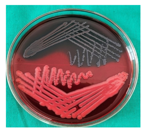
Figure 1. Biofilm detection on Congo red agar

Among 100 isolates of K. pneumoniae maximum biofilm-producing isolates were from urine 12 (12%) followed by ETT 9 (9%), pus 7 (7%), blood 8 (8%), and least in sputum 3 (3%) and CSF 1 (1%) (Table 1).