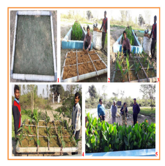
Fig. 2. Pictorial representation of FRWTS at GBPUA&T, pantnagar