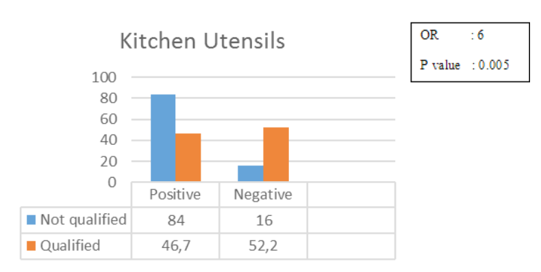
Fig. 2. Hygiene and sanitation of kitchen utensils

Logit Y= -2.516 + 1.616 hygiene and sanitation of food processing + 2.265 canteen environment*kitchen utensils