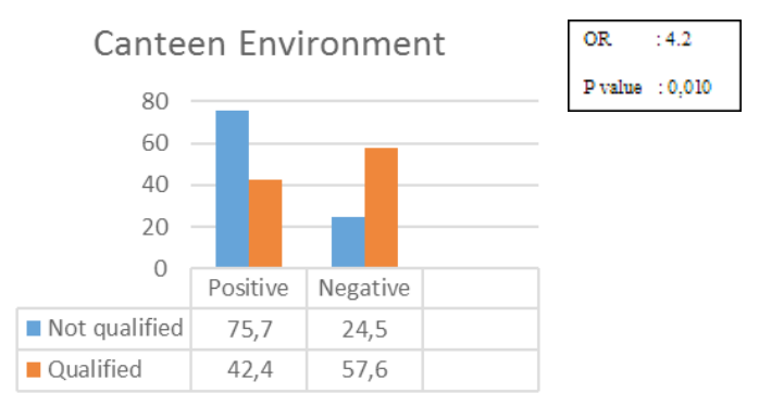
Fig. 3. Hygiene and sanitation of canteen environment