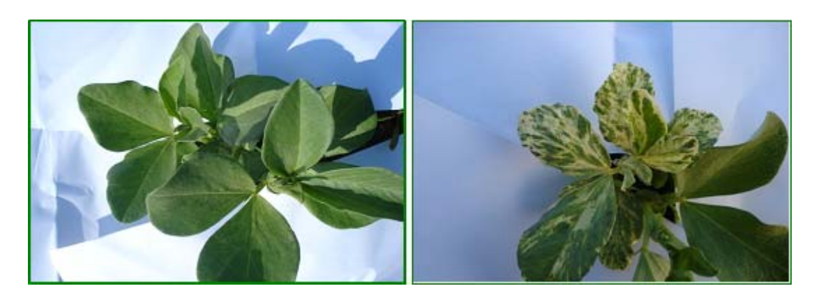
Fig. 1 .Symptoms of BYMV on the leaves of broadbean.A= Healthy plant;B=Infected plant J PURE APPL MICROBIO, 7 (1), March 2013.

Results indicated that the treatment with rhizobia significantly (P=0.05) improved plant growth in terms of fresh weight and nodule numbers. The foliage fresh weight was higher in both the virus-inoculated and virus uninoculated treatments that received the rhizobia (Table 1). For root fresh weight, however, plants treated or not with the rhizobia showed similar weight when inoculated with the virus. In relation to this, the virus significantly (P=0.05) reduced nodule formation on roots of plants from seed treated with rhizobia (Table 1).