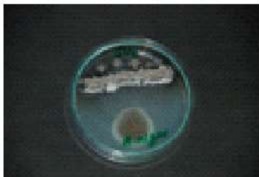
Fig. 1. Primary screening : Antifungal activity of active strain against Aspergillus niger

The active strain was identified as Streptomyces coelicolor Strain SU6 (JQ828940) by 16s rRNA partial gene sequencing.