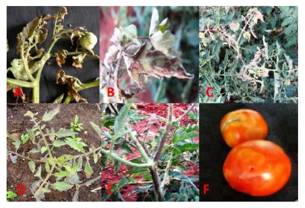
Fig. 1. Bud blight disease symptoms on tomato includes wilting of plants and deformation of fruits (A), necrotic spots on leaves (B), bud blight (C), leaf bronzing and stunting of plants (D), necrotic streaks on stem (E) and Chlorotic spots on fruits and reduction in fruit size (F).

cDNA was synthesized from mRNA through reverse transcriptase in a 20 <sup>1</sup>/<sub>4</sub>l reaction mixture containing 5 ng of total RNA isolated from the infected and non infected samples of tomato. M-MuLV RT-Kit from Bangalore Genei was used for RT-PCR. The degenerate primers pair GBNV-CP.F 5' ATGTCTAMCGTYAAGCAVCTHAMCG 3' and GBNV-CP.R5' TTACAMTTCCARM GAAGKRCHAG 3'was used for amplification of CP gene of GBNV. Amplification was performed in an automated Thermocycler (JH, BIO, Germany) programmed for one cycle 5 min as initial denaturation at 94°C and 35 cycles involving 30 s of denaturation at 94°C, 1 min annealing at 52°C, 2 min for extension at 72°C, followed by one cycle of final extension for 10 min at 72°C. RT-PCR amplified products were analyzed by electrophoresis in 1% agarose gel at 60V for 1 h and staining with ethidium bromide.