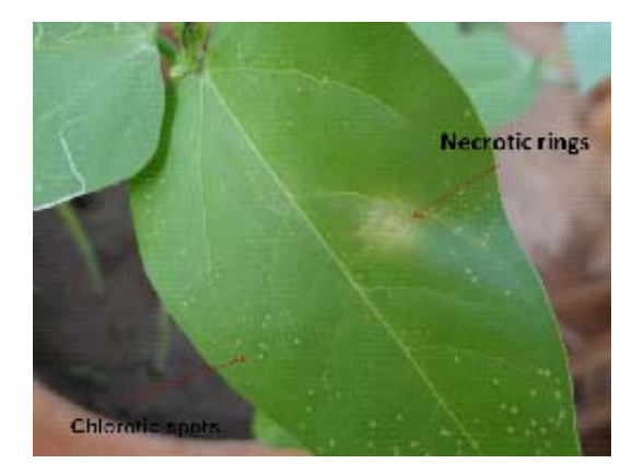
Fig. 2. Mechanical transmission of GBNV from bud blight tomato sample on cow pea