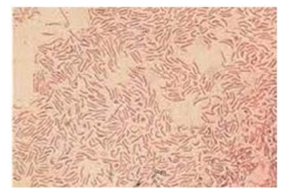
Fig. 1. Gram stain of H.pylori from culture plate

Maximum 27 were detected positive by histopathological examination followed by 25 by IgG for H.pylori , whereas only 17 were culture positive, 21 by rapid urease test and DFA was