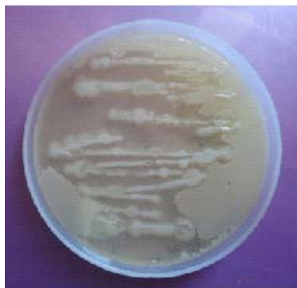
Fig. 2. Re-isolated local Bt isolate from dead larvae