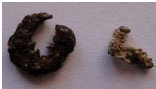
Fig. 1. H. armigera larvae showing toxicity due to native Bt isolate

damage inflicted by H. armigera was recorded to be minimum with the application of NSKE followed by Bt at an interval of 20 days from the pod initiation stage onwards 13 . Similarly, combination of B. thuringiensis (Dipel) and deltamethrin (0.004% or 0.002%) was most effective in reducing the damage due to pod borers in pigeonpea with highest net