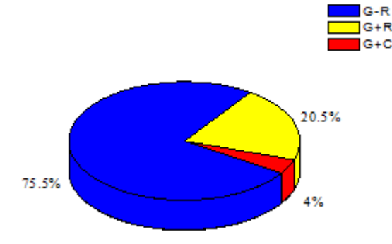
Fig. 3. Diversity of rhizospheric isolates on the basis of Gram's reaction

R: S ratio determines the relative stimulation of the microorganisms in the