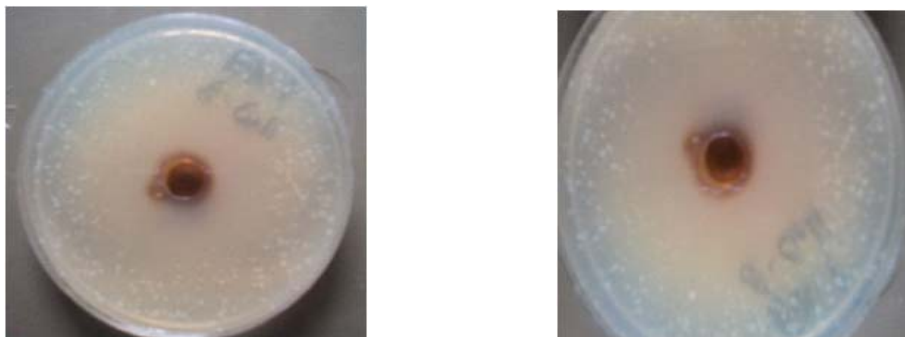
Fig. 2. Effect of Tribulus terrestris fruit extract on the bacterial growth of S. pneumoniae and P. aeruginosa

the two major component in the methanol extract and the other seven components were considered as minor constituents and ranged between 1.06 % for 2-(Bromomethyl)-1,8-Dimethoxy-9 and 10.12% for Cyclopentasiloxane, Decamethyl- Silane.