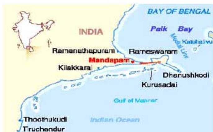
Fig.1. Map of Mandapam, Rameshwaram

Among the two isolates VITDAMJ 1 was capable of removing strains of blood, ketchup, crystal violet, chocolate sauce. Percentage of stain removal was analysed for all the fabric pieces stained with blood, ketchup, chocolate and crystal violet and were washed with fermented sample, surf excel, uninoculated MSM medium and distilled water. In this analysis surf excel showed complete stain removal for ketchup stain and about 90-95% stain removal for blood and chocolate stain. Whereas the sample showed an effective stain removing ability up to 95% for ketchup stain and