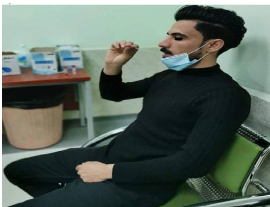
Figure 1. After stroking the submandibular gland by the subject for one minute, he collects the saliva using a nylon swab

Data were gathered from every participant regarding the patient demographics, duration of the