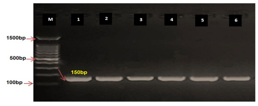
Fig. 2. Agarose gel electrophoresis and genomic DNA isolated from E. coli observed PCR product analysis bfpA gene in E. coli . M: Marker (100-1500bp). All lines (1-6) were +ve PCR at 156bp PCR size of product.

Most types E. coli are harmless and cause diarrhea. Some strains E. coli (i.e. E. coli O157:H7) can cause dangerous symptoms, such as stomach cramps, vomiting, bloody, and diarrhea. Successful management of any infectious disease requires recognition of the causative agents and treatment of signs manifested by the disease. This study was conducted to detect E. coli isolation rate and virulence factors of pathogenic E. coli that isolated from DEC in the Wasit province (Iraq). Diarrhea is a multifactorial disorder related to a wide range of pathogens, including bacteria, viruses, and parasites.<sup>21,30</sup> Most commonly isolated bacteria among DEC is E. coli when applying traditional and molecular methods. The results of the current study are in agreement with those of Begum et al.,<sup>31</sup> conducted in Mizoram. In the current study,