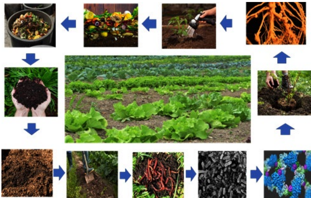
Fig. 1. Microbial Way of composting.

Inadequately handled compost may be a disease source in the environment. Reports in municipal wastes, sewage sludges and other organic sludge found to contain a number of harmful pathogens. 54 Sewage sludge is generally richer in pathogens than municipal solid waste. 55 Pathogens found in composting can be viruses, bacteria, protozoa or helminths especially when the components are municipal solids waste and sewage sludge. Thus, along with providing nutrients and beneficial microorganisms, the organic fertilisers may sometimes be seen to spread pathogenic microorganisms into agroecosystems. 56-58 In certain anaerobic composting systems presence of common pathogens such as Salmonella , Clostridium , Campylobacter , Listeria monocytogenes and Escherichia coli were found during early phases. 59,60 It is also suggested that the thermophilic phase of composting is responsible for killing the pathogens. 61