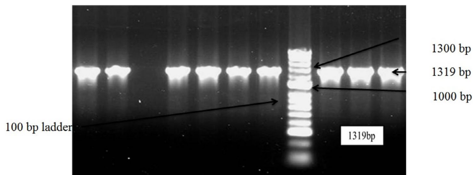
Fig. 2. Agarose gel electrolysis. The gel shows amplification of 1319 bp pair fragments of mecA gene. Lanes 1,2 (from left) shows coagulase negative, while lane 3 showing negative samples, and lane 8 shows 100bp ladder. Lanes 4,5,6,7,9,10,11 shows positive amplification of 1319 bp of Staphylococcus species harboring mecA gene.