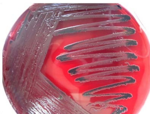
Fig. 1. Salmonella typhi colonies on XLD agar

Biochemically tests results of S.typhi isolates were revealed on TSI, Sugars, Oxidase, Indole, Ureases and simmone citrate test. In