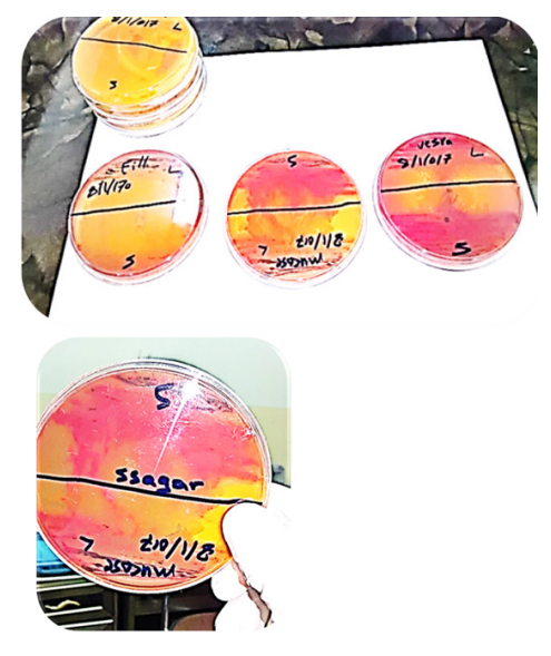
Fig. 2. Pink, round and black center bacteria from mucus, viscera, and gill samples cultures in SS agar.