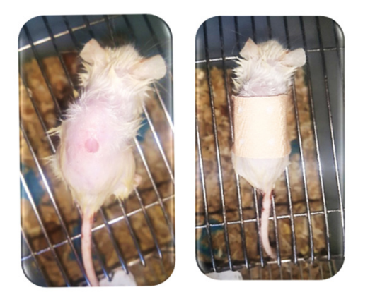
Fig. 3. Murine test: a/ 1.5×1.5 cm-tissue full thickness Miltex<sup>®</sup> standard biopsy punch surgical skin wound. b/ plaster covered wound.

Fig. 2. Pink, round and black center bacteria from mucus, viscera, and gill samples cultures in SS agar.