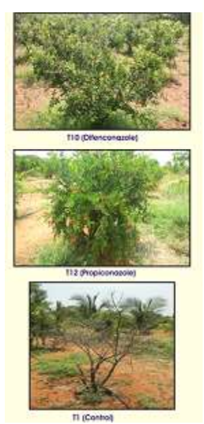
Plate 1. General view of experimental plot