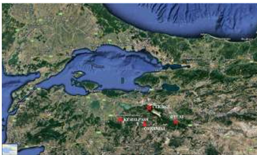
Fig. 1. Map of Sample Locations in Bursa, Turkey

A total of 36 phyla and 6 candidate phyla were identified from in this study. Bacterial