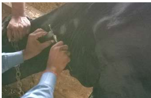
Fig. 1. Measuring skin flap with Vernier Caliper of T.B. Infected cattle