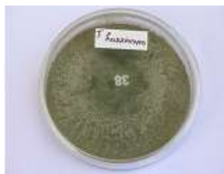
Fig. 1. Trichoderma harzianum Th azad /6796 strain in PDA medium