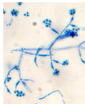
Fig. 2. Trichoderma harzianum Th azad /6796 strain under microscope

The genomic DNA was extracted from isolated fungal strain Trichoderma harzianum Th azad -6796/09 and universal ITS-1 forward primer and ITS-4 reverse primer were used for the amplification and sequencing of the 18S rRNA gene