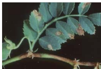
(b) Chickpeas stem and leaves with lesions of A. blight