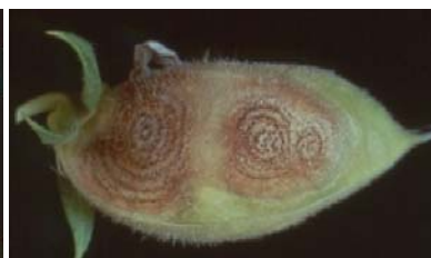
(c) Chickpeas pod with circular lesions of A. blight