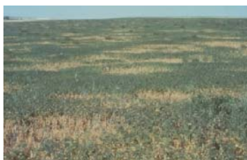
(a) Ascochyta Blight infected patches in field of Chickpea at flowering