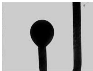
Fig. 2. An image of the hook of the device measuring the Neuer surface tension

The isolated bacteria were cultured on mineral salt agar medium (containing 1% oil as the carbon source). To do this, one ml of the overnight culture (18 hours) of the bacteria on a BHI broth was removed by the sampler and released on