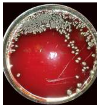
Fig. 1. Sample of a pour plate of the studied isolate