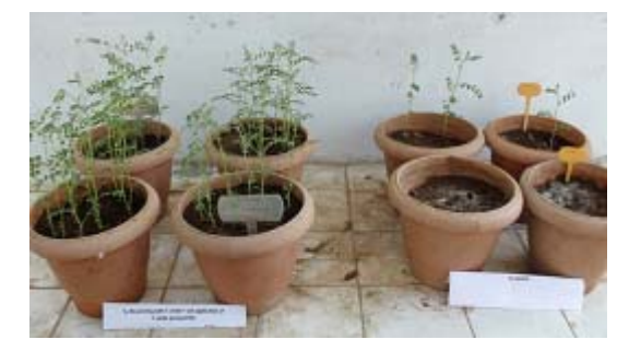
Fig. 6. Chickpea seedling infected by wilt and collar rot