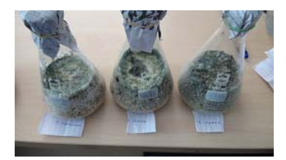
Fig. 1. Mass multiplied culture of T. harzianum , T.viride and T.virens in solid based sorghum medium

by Prasad and Rangeshwaran, 2000c also indicated that soil application of T. harzianum granules before sowing resulted in significantly less rhizoctonia root rot incidence in chickpea. Lewis et al. (1995) reported that amending soilless mix