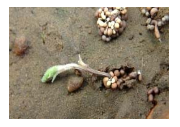
Fig. 5. Efficacy of Trichodermaviride bioprimed along with T. viride enriched FYM in green house conditions

wilt by 30-45.8% (De et al. , 1996). The present study clearly indicates the positive effect of the three bioagents on seed and plant health. Seed biopriming with T. viride prior to sowing along with soil application of FYM primed T. viride was most effective in controlling wilt and collar rot of chickpea under green house as well as can be further applied in large scale for better crop management in field conditions.