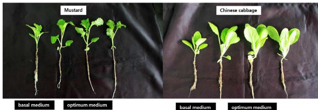
Fig. 3. Effect of Acinetobacter calcoaceticus SE370 in culture medium on mustard and Chinese cabbage plants