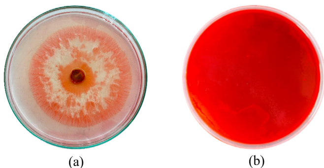
Figure 2. Image (a) represents Cellulase activity of T. asperellum . (b) represents the Control